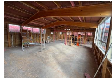
Old Room 3

Mā te Atua koutou e manaaki i ngā wā katoa May God always bless you.