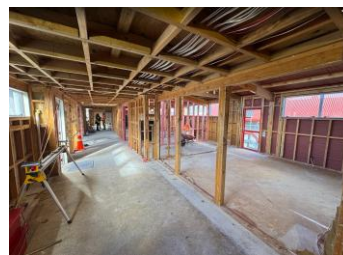
New library space on the right.

All windows and doors from the building are also being replaced. If you are interested in taking any of these items, please see me in the office. I can put your name on it, literally.