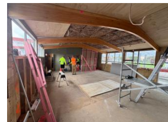
Bats are going in and some wall linings are on.