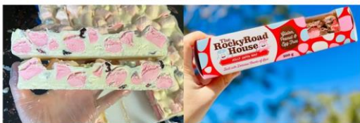
200g Rocky Road Bars - $12

Available in 5 flavours: Raspberry Road, Milk Choc Lane, Jolly Jaffa Way, Salted Caramel Corner, White Cranberry Close